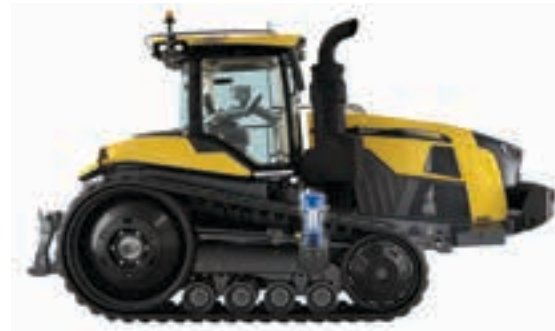
Figure 2: The MT800 Series, with Smart Ride Plus, allows for easy adjustment of the weight distribution. This results in reduced slip, improved ride comfort, and improved overall performance.