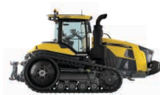
Figure 1: A tractor goes to work without proper tractor and implement weight distribution. This results in insufficient front weight on the tractor, and as a result increases slip.

When equipped with Smart Ride Plus suspension, the MT800 Series features a load-leveling suspension system. With the push of a button in the cab, Smart Ride Plus uses hydraulic pressure in the track suspension elements to raise or lower the front of the machine. This results in better weight distribution for better traction, ride, and overall performance.