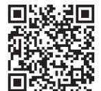
Scan here to download the app.