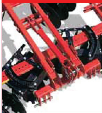
Tool-free, cutting-angle adjustability