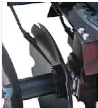
Blade scraper kit/triple-lip sealed bearings