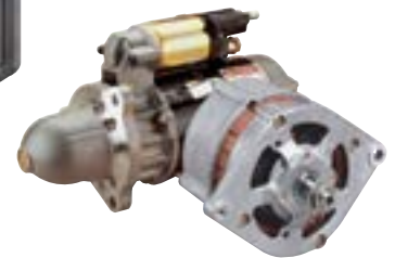
STARTERS AND ALTERNATORS