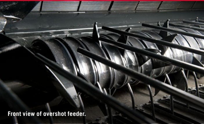
Front view of overshot feeder.

Boost your bale production with your choice of three reliable feeding systems: overshot, undershot and direct feed. From hay and silage to dry crops such as cornstalks and straw, each feeding system is engineered to perfectly handle your crop from pickup through to the bale chamber.