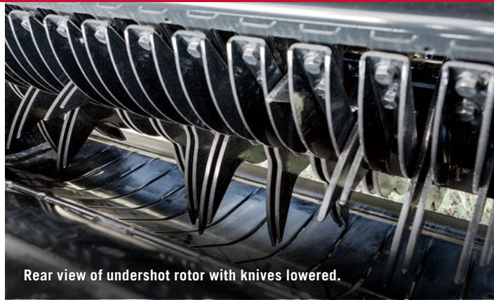
Rear view of undershot rotor with knives lowered.