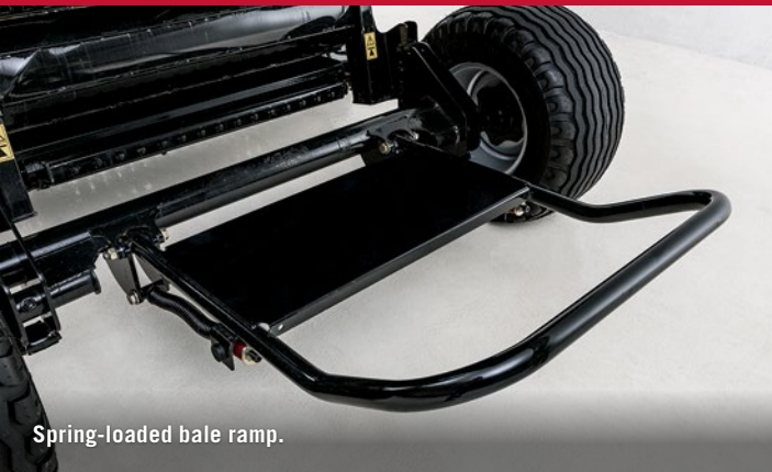
Spring-loaded bale ramp.