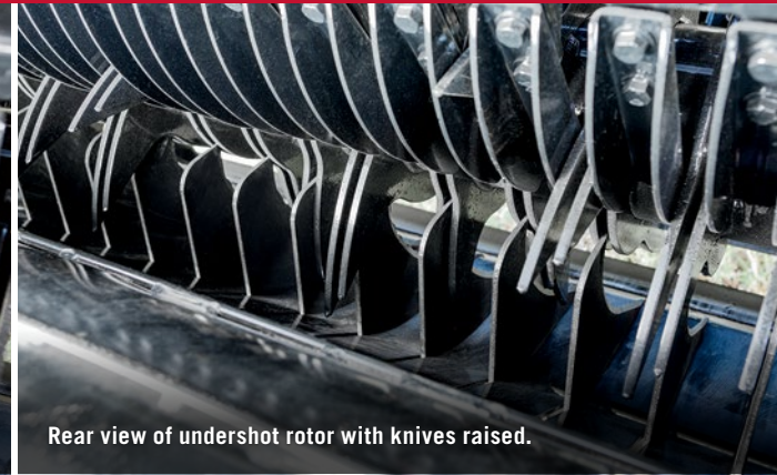
Rear view of undershot rotor with knives raised.