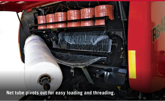
Net tube pivots out for easy loading and threading.

No matter which option you choose — net, twine or net and twine — durable, Case IH tying and wrapping systems set each bale up for success. A redesigned net wrap system, along with twine delivery improvements, gives you maximum control with minimal adjustments. Plus, all operation and adjustments can be made from the bale monitor inside the cab. These easy-to-use systems ensure consistent placement, which means your last bale will look every bit as good as your first.