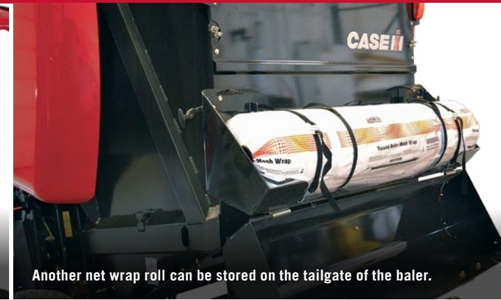
Another net wrap roll can be stored on the tailgate of the baler.