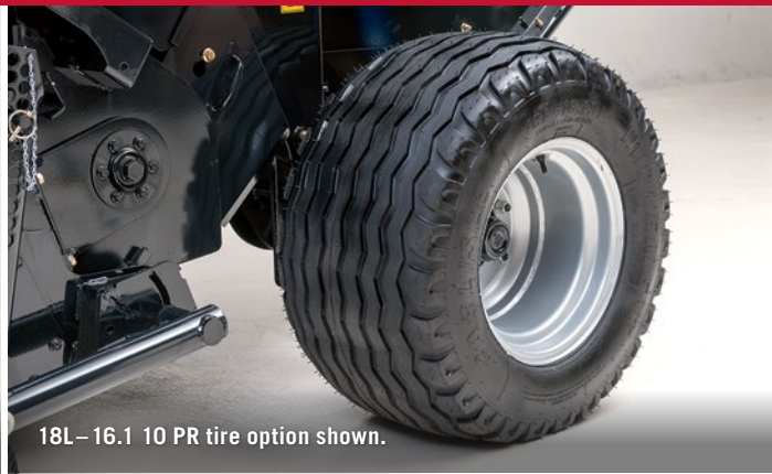
18L-16.1 10 PR tire option shown.