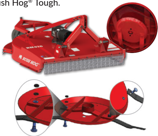
Hardened, hex-shaped blade bolts with mating hardened bushings and reinforced blade pans