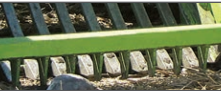
Wide grate for minimum till picking