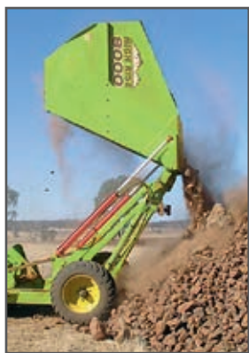
Bigger rock piles or loads trucks

Heavy wire batt springs hold batts in place and cushion shock loads. Three batt reel with high trip clearance provides superior performance.