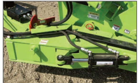
Optional hydraulic swing hitch