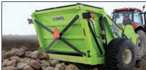
6.5' dump height makes it easier to build larger rock piles