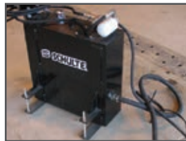
Optional Reservoir Kit