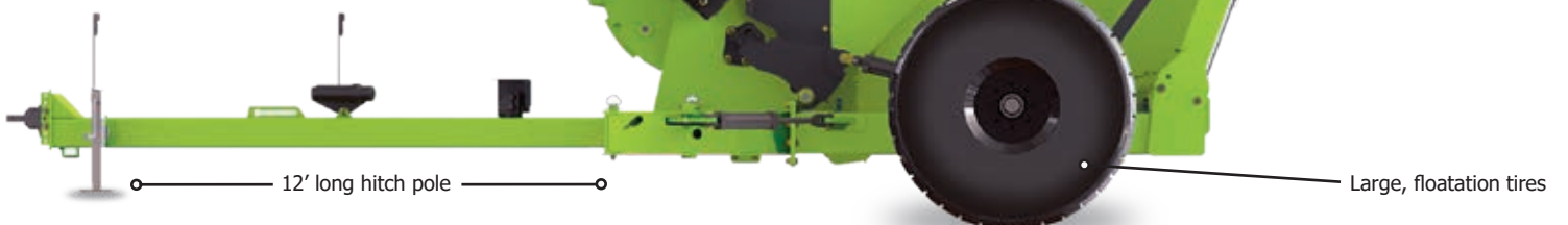
12' long hitch pole