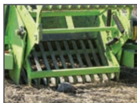
Minimum till wide grate & reel 3 9/32" spacing