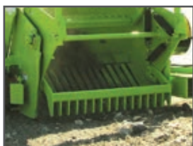
Standard grate & reel 1 1/2" spacing