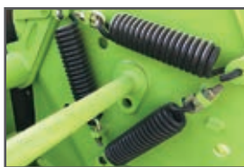
Heavy duty batt spring system