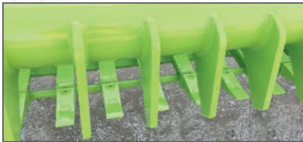
450 BNH steel for heavy duty windrowed picking

Greater range of grate movement (lower picking and higher lift).