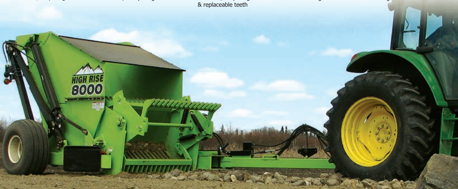
Optional Round bar grated back bucket