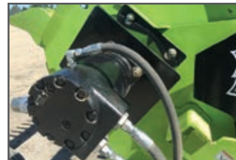
The direct drive motor has a built in cushion valve No chain or sprockets used