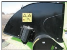
Optional CE Shielding Kit