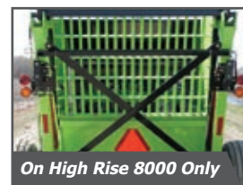
On High Rise 8000 Only