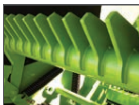
Heavy duty grate & reel 450BNH 1/2" spacing & replaceable teeth