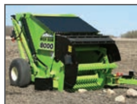
Optional CE Shielding Kit