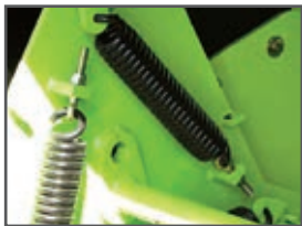
Heavy duty batt springs