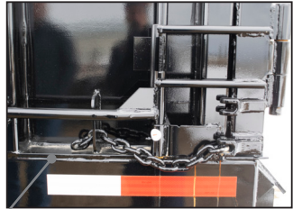
SAFETY DOOR OPENER The safetydoor opener is optional for the Latch closure