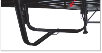
SPARE TIRE CARRIER