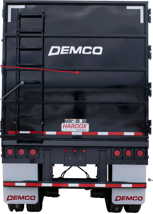
NEW HINGES New mounting of hinges to better align the rear door