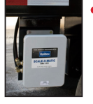
SCALE Haldex Scale-O-Matic