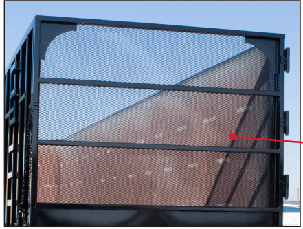
VENTED TAIL GATE Optional vented tail gate