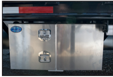
TOOLBOX Aluminum body