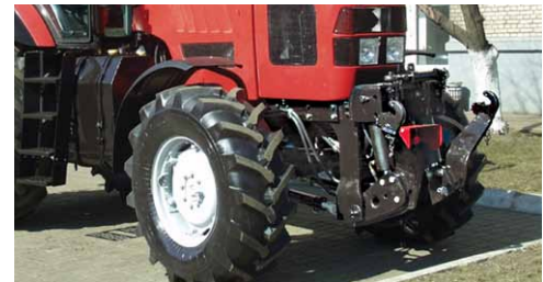
Available front hitch and PTO package