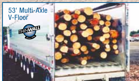
53' Multi-Axle V-Floor