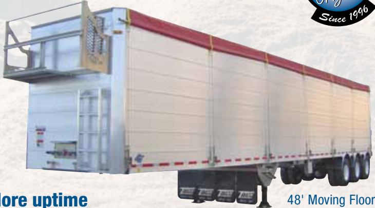
48' Moving Floor