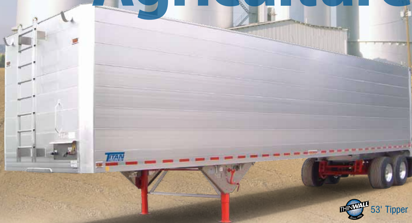
THINWALL 53' Tipper Since 1966