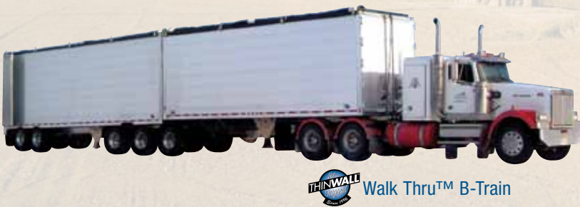
Walk Thru™ B-Train