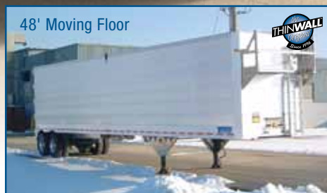
48' Moving Floor