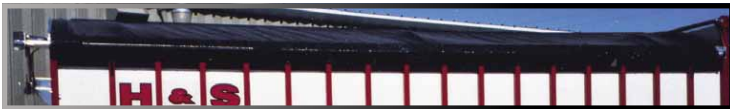
Shown with the optional heavy-duty side-to-side electric roll tarp.

An optional gravity unload grain hopper for grain is available for wide body boxes with a top hinged gate.