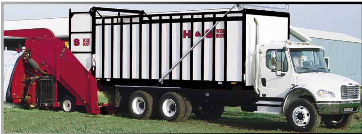
H&S Wide Body™ shown with barn doors and optional front-to-rear electric roll tarp.